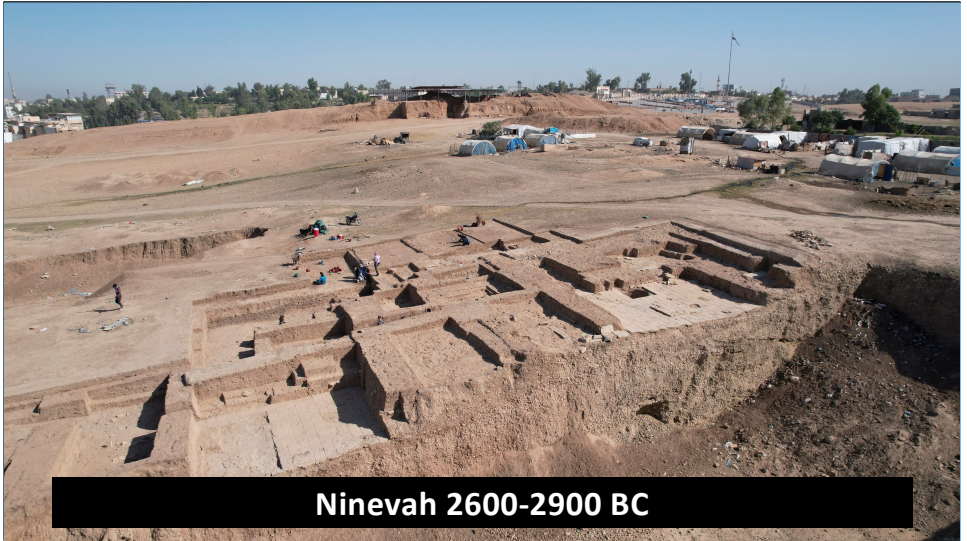
Ninevah 2600-2900 BC