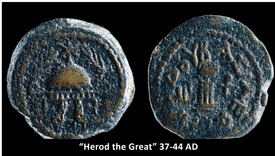
"Herod the Great" 37-44 AD