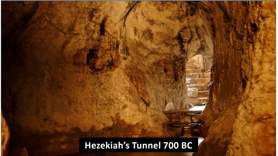
Hezekiah's Tunnel 700 BC