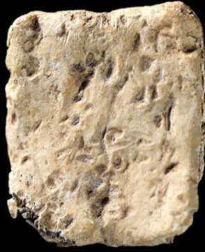
Mt. Ebal Curse Tablet (1200 BC)

Mt. Ebal Curse Tablet???, 1200 BC, West Bank