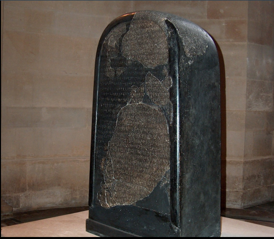
Moabite Stone (Mesha Stele) "House of David" 850 BC