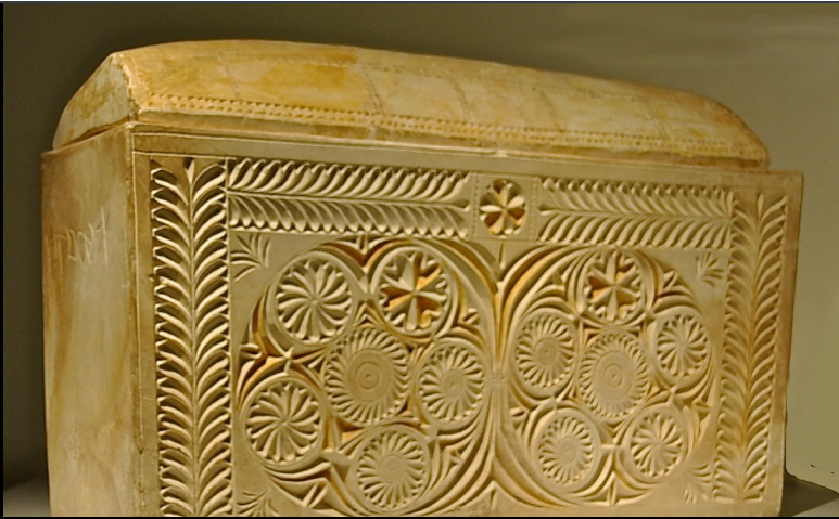
Caiaphas Ossuary 44-50 AD